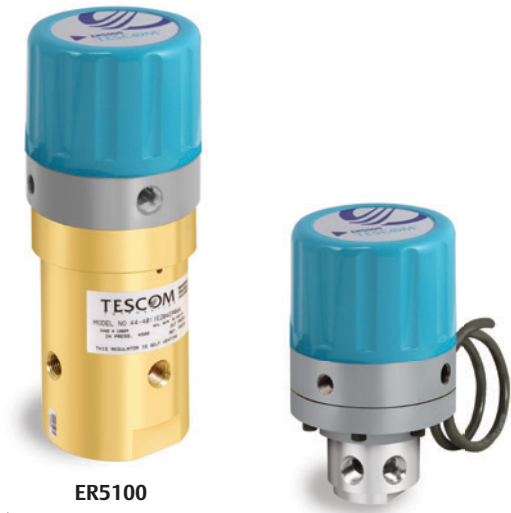
ER5100 (WITH 44-4000 SERIES REGULATOR)