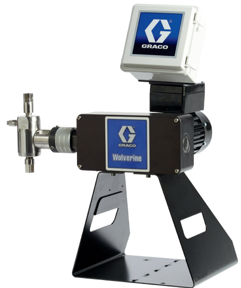
AC operated Harrier mounted on a Wolverine