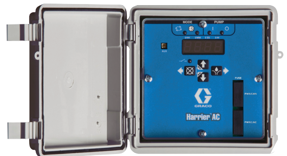
Harrier AC Controller