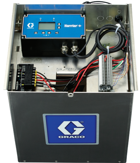
Harrier+ Two Battery Control Box