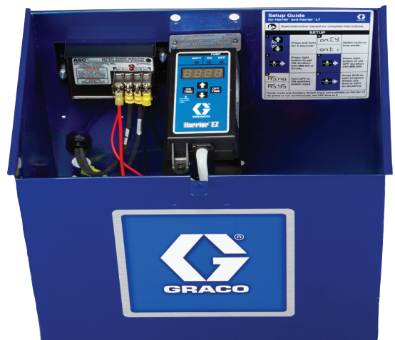
Harrier+ One Battery Control Box