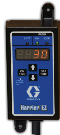
Harrier EZ and Harrier Controllers