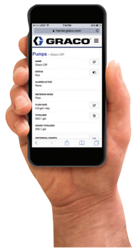
Monitor your Harrier+ controller right from your cell phone!