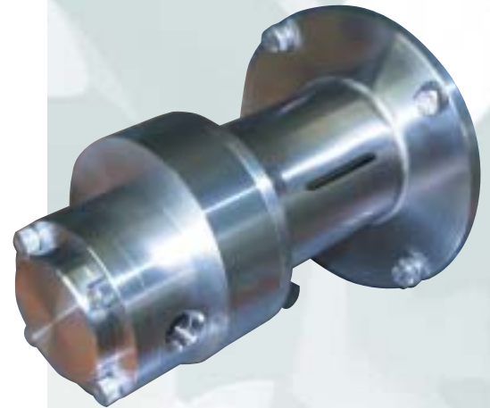
Liquiflo MAX™ Series Helical Gear Pump